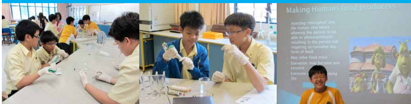
OTDP - Science

The subject areas and their respective programme objectives are as follows: